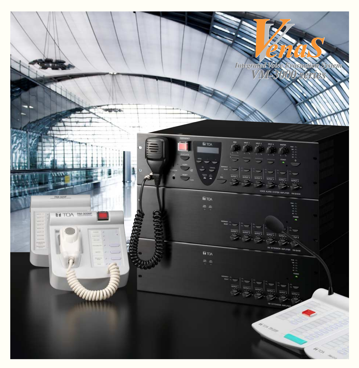
Emergency Voice Alarm System Incorporating Digital Audio PA, Paging and BGM